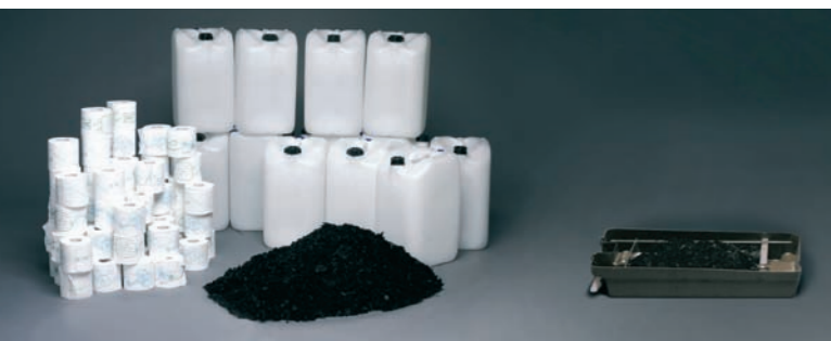
The humus you empty from a MullToa is only 5-10 per cent of the original volume. The picture shows how much the toilet can handle before you will need to empty it for the first time. Incredible, isn't it?

A Swan Nordic Ecolabel means that the product has been tested and environmentally approved in accordance with criteria established by the Environmental Protection Authority, the National Board of Health and Welfare and the Consumer Protection Agency in Sweden, Norway and Finland. This involves the most extensive testing and includes both environmental testing and quality controls. If you want the most environmentally-friendly biological toilet, the Swan Nordic Ecolabel is a safe bet. MullToa is the only brand on the market with this label. Test reports in their entirety can be viewed at: www.mulltoa.com